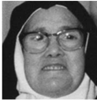
Lucy II (1)