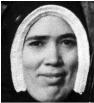
Lucy I (1)

Here are some of the comparisons between the ‘two Sister Lucy’s that appear quite startling, with the early pictures of the visionary on the left (Lucy 1), and the later more publicized photos on the right (Lucy 2):