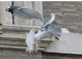
Attacked; Gull on prow; Captured and killed