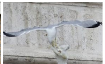
Dove captured by gull Immobilized